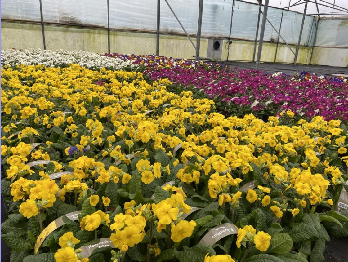
Polyanthus 6 Pack

20 packs per shelf, 180 packs per trolley