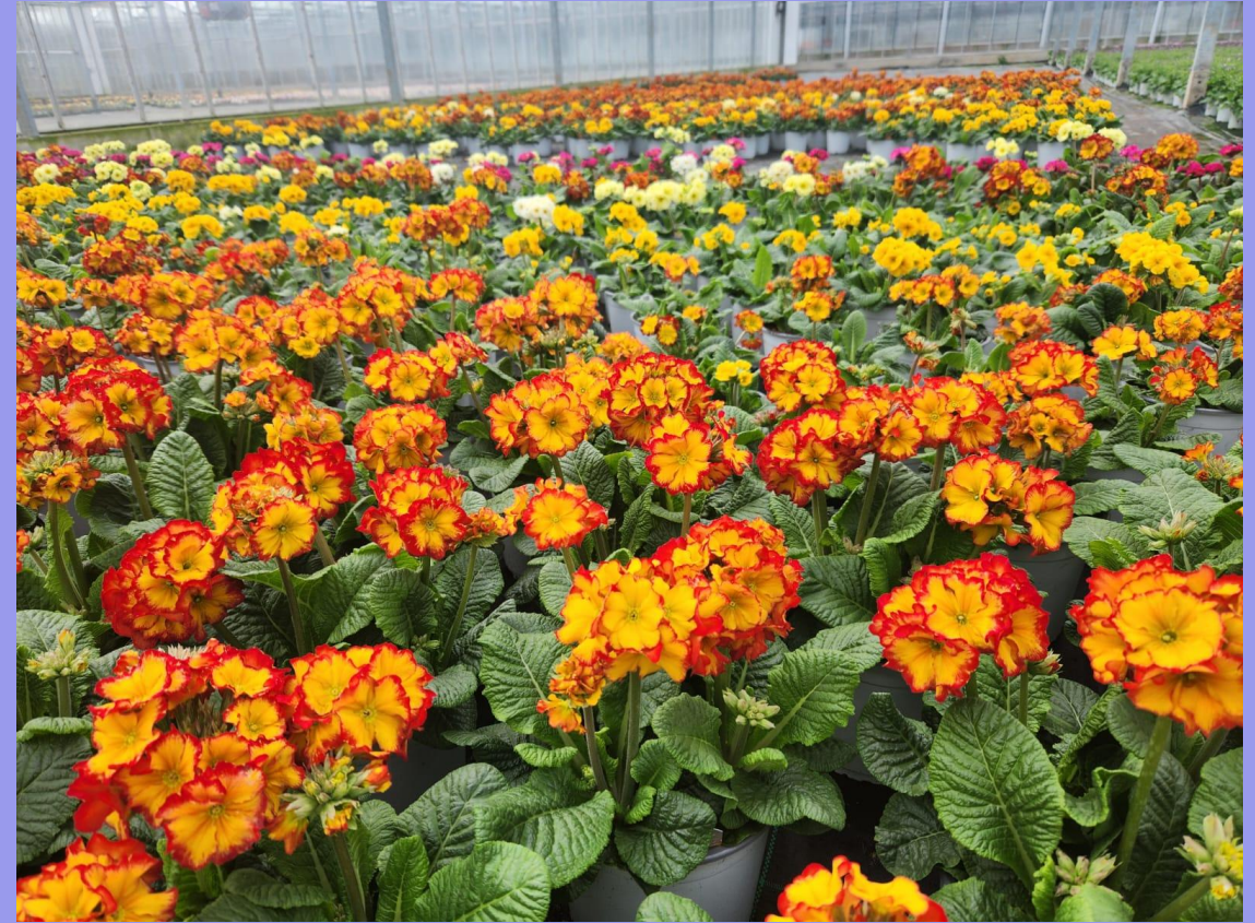
Polyanthus Showstopper 19cm

20 packs per shelf, 180 packs per trolley